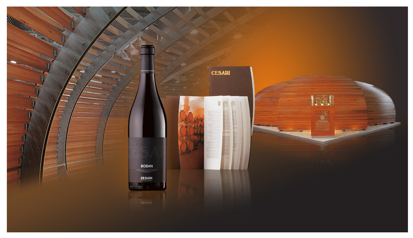
Cesari global identity: packaging, brochure, stand

These are the components of an effective exhibition architecture that communicates, the result of a composite of across-the-board and interconnected expertise : exhibition design, interior design, interior decoration, merchandising, food design, experience.