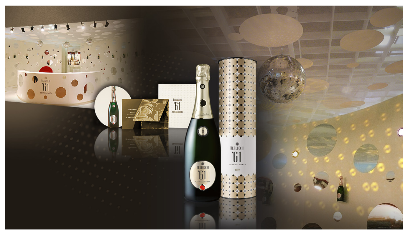
Berlucchi global identity: packaging, secondary packaging, brochure, stand

Taking brand value into a physical space, with a formal, comprehensible language, pursuing that long-awaited sense of surprise and involvement that typifies the visitors to a trade fair.